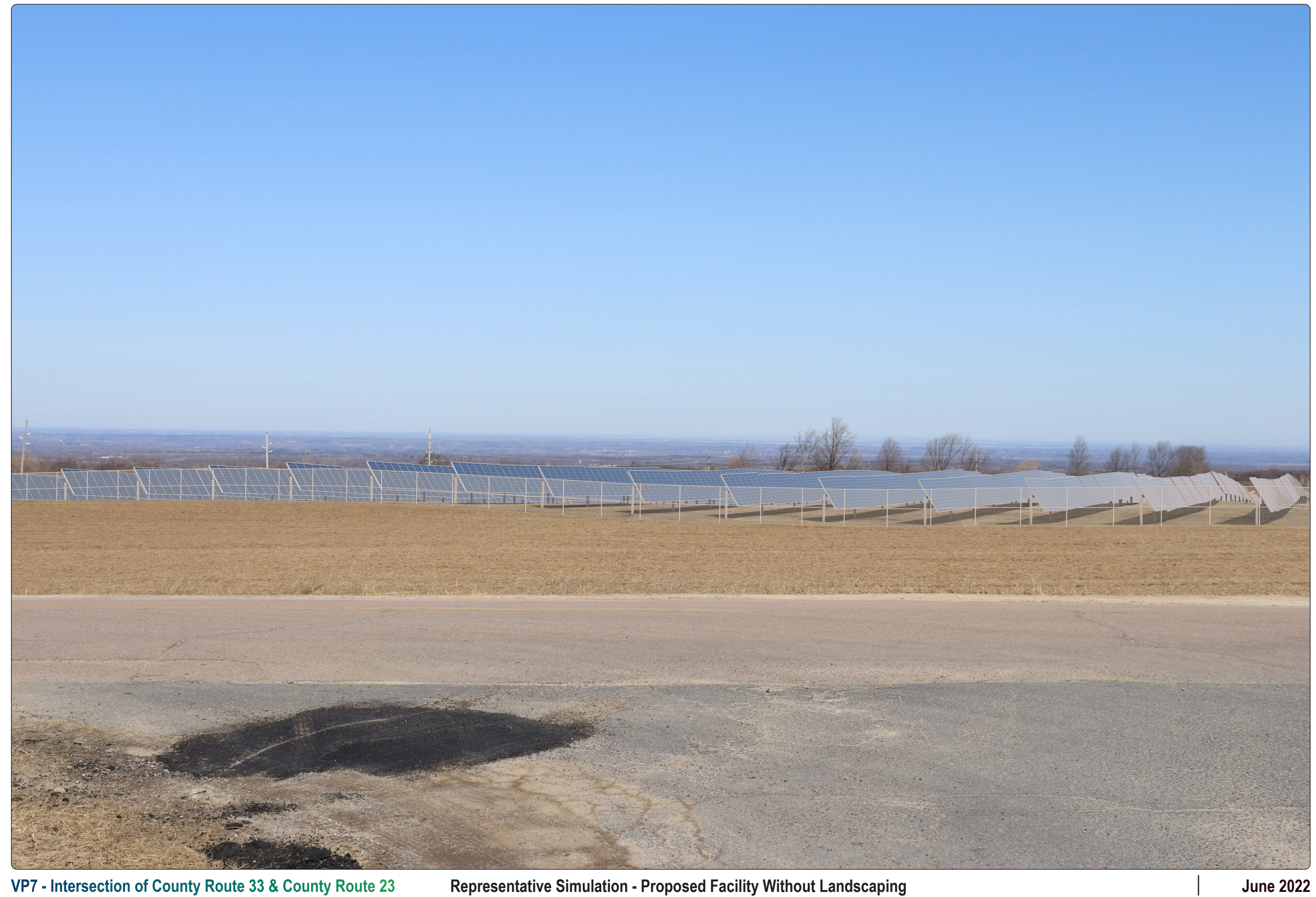
VP7 - Intersection of County Route 33 & County Route 23