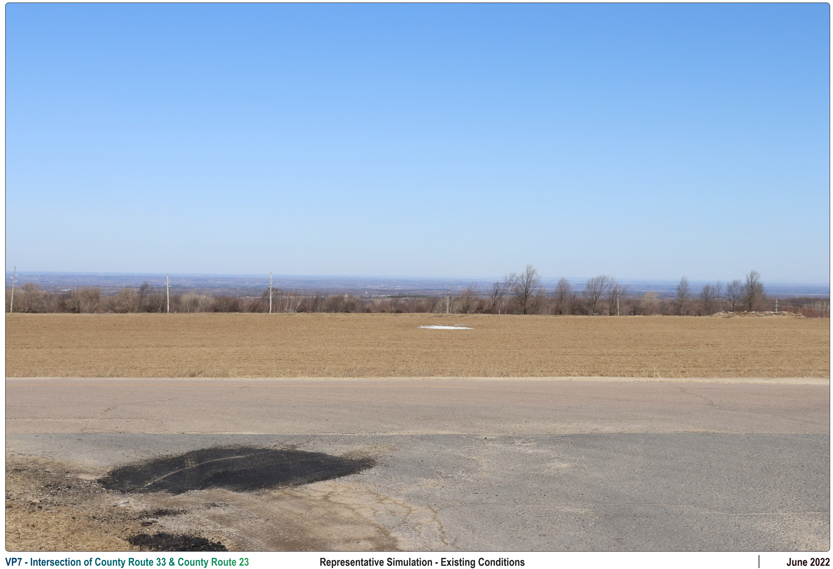
VP7 - Intersection of County Route 33 & County Route 23