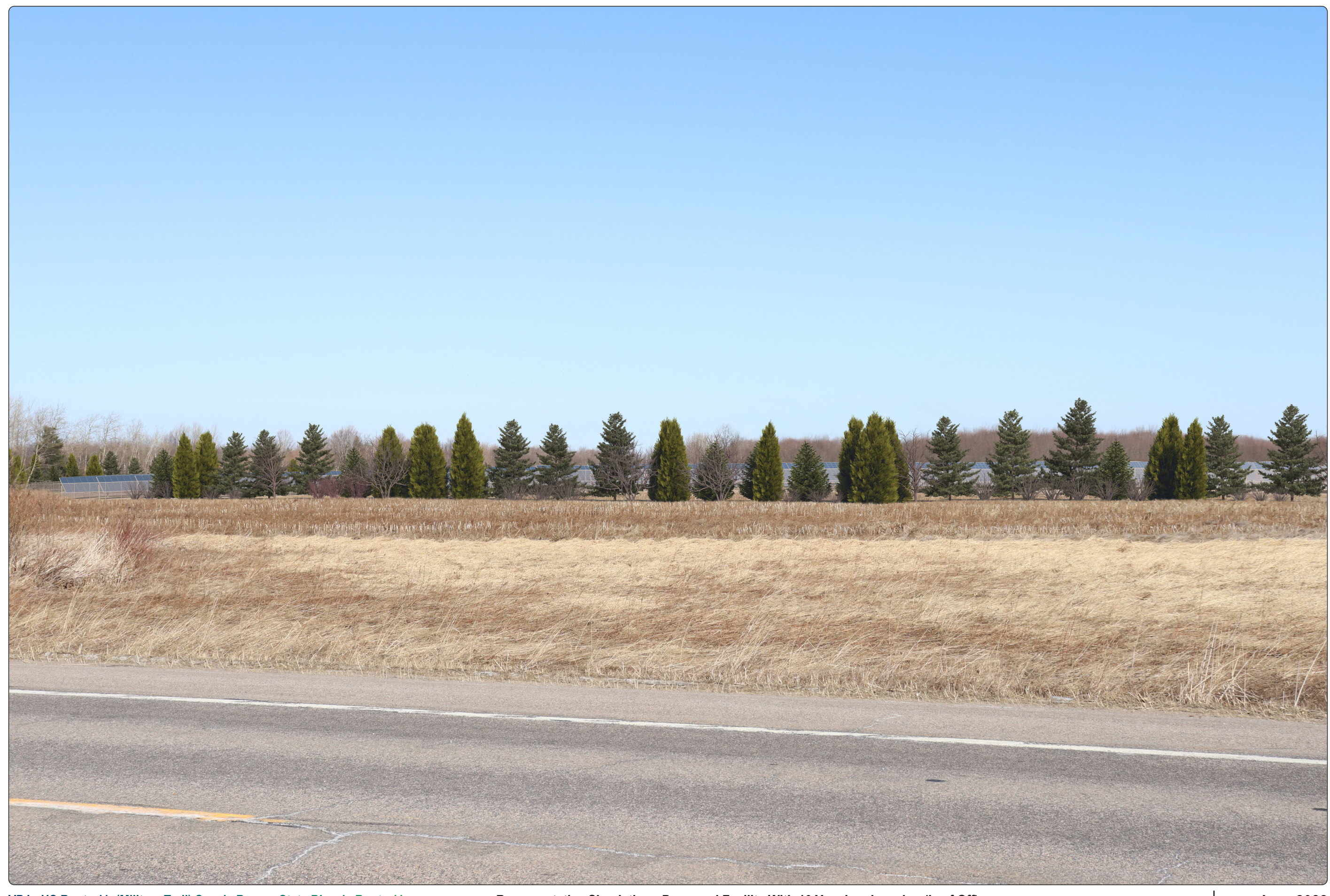
VP4 - US Route 11, (Military Trail) Scenic Byway, State Bicycle Route 11