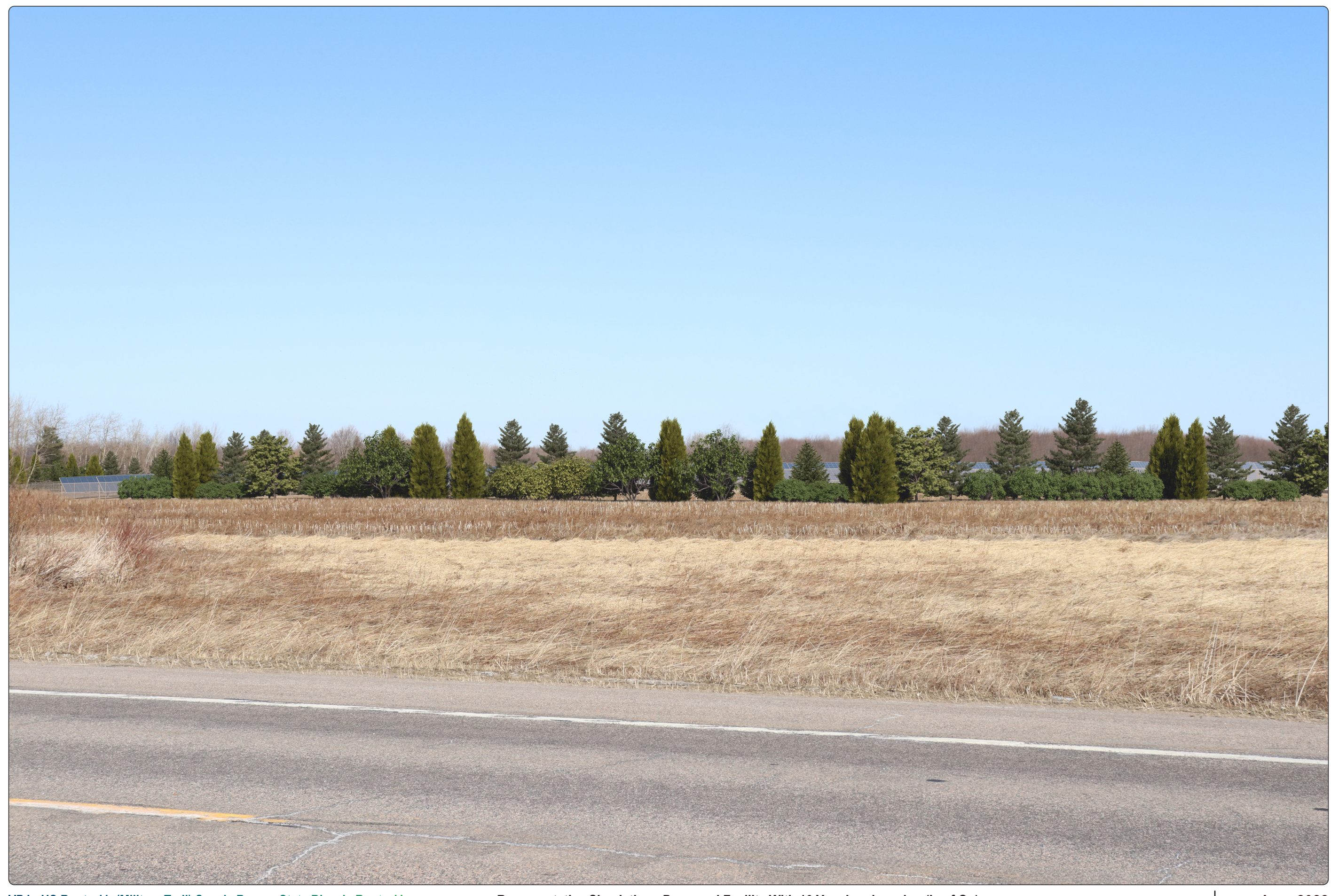
VP4 - US Route 11, (Military Trail) Scenic Byway, State Bicycle Route 11